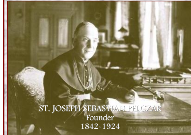
ST. JOSEPH SEBASTIAN PELCZAR Founder 1842-1924

Pope St. John Paul II was a great spiritual father and friend of our Congregation. Our Sisters were privileged to serve in his Episcopal and Papal offices as secretaries, cooks, aides and household staff